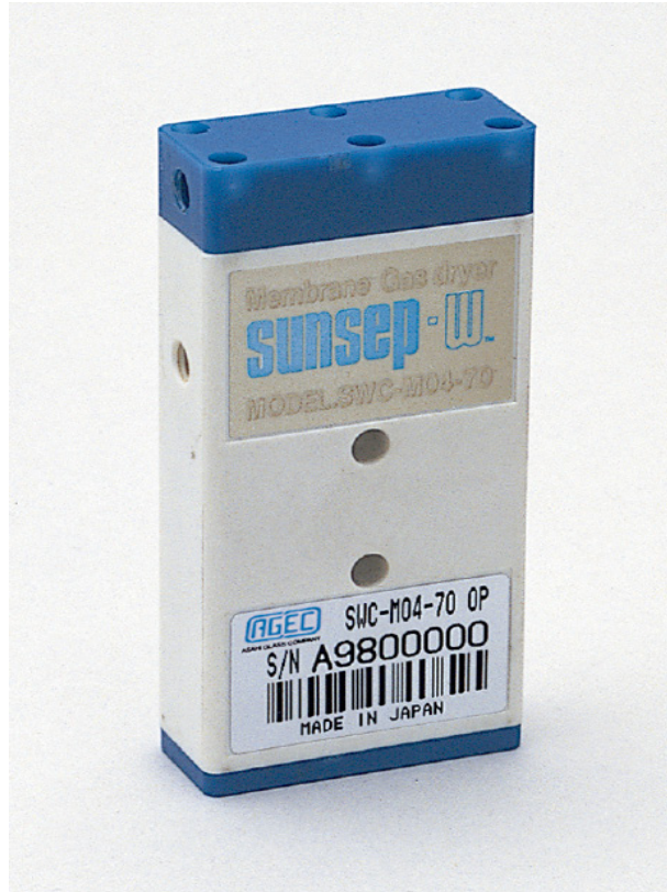
Dryer shown actual size

The SWC M04-70 dryer from AGC Engineering is the ultimate “point-of-use” dehumidification device. This dryer consists of a tube bundle made from a very hydrophilic fluoropolymer with a specific affinity for water vapor. The principle of water transfer is based on the vapor pressure differential between the inside and outside of the tube bundle; water molecules move from the wet gas inside to a dry purge gas, which also carries the molecules off the outer surface of the tubing. This water transfer will continue as long as the moisture gradient is maintained.