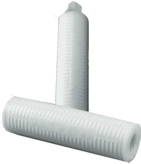
Figure 1: Memtrex PM (MPM) Pleated Filters