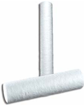
Figure 1: Hytrex RX Depth Cartridge Filters