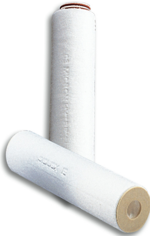
Figure 1 : Selex Depth Cartridge Filters