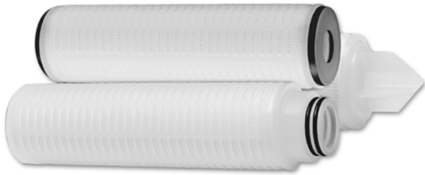
Figure 1: XPleat PES Filters