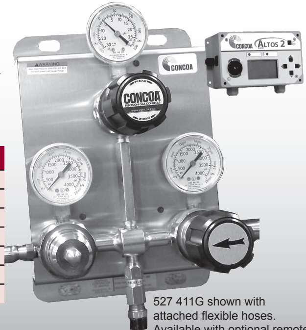
527 411G shown with attached flexible hoses. Available with optional remote alarm.