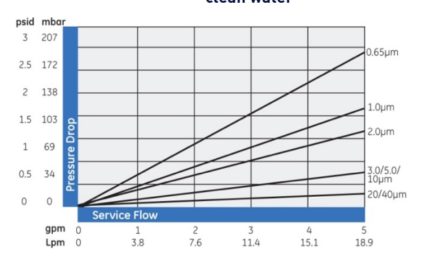
Figure 3: Flotrex AP medium capsule flow performance in clean water'