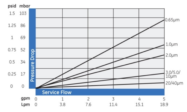
Figure 4: Flotrex AP large capsule flow performance in clean water