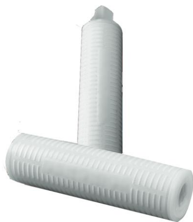
Figure 1: Memtrex PC Filters