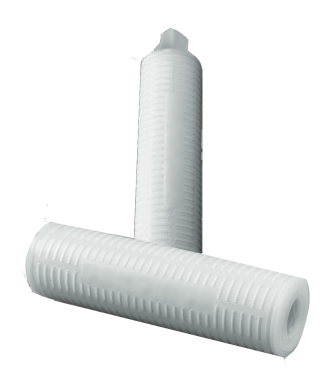
Figure 1: Flotrex PN Filters