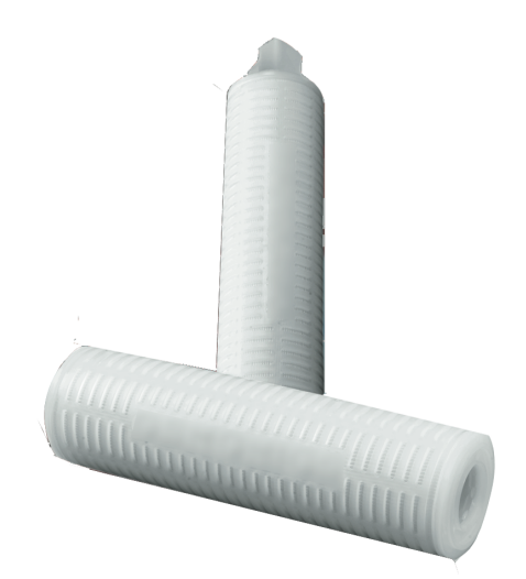
Figure 1 : MemtrexMP-B Filter