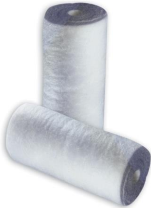
figure 1: Aquatrex filters