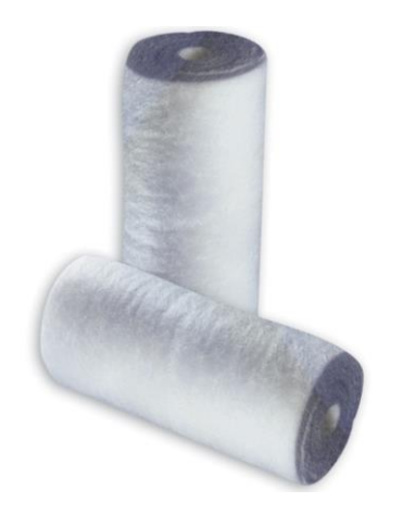
figure 1: Aquatrex filters