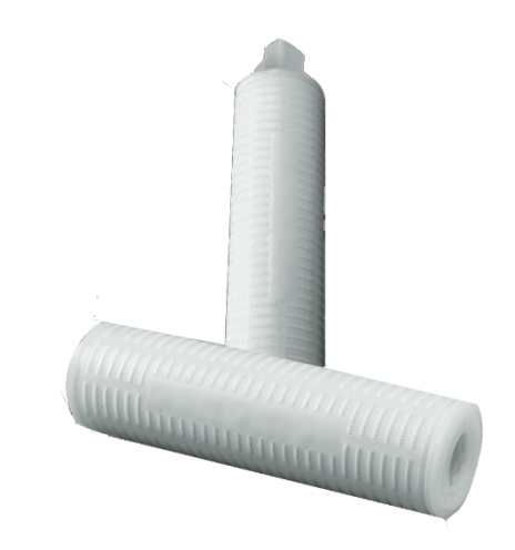
Figure 1: Memtrex HFE filter

Memtrex* HFE are made entirely from fluoropolymer materials including Halar (ECTFE). Halar is a trademark of Ausimont.), and PTFE. Halar is an industrial-grade fluoropolymer with excellent solvent resistance. MHFE benefits of the edge lamination technology assuring a lower pressure drop and increasing flow rate. MHFE filters can withstand the harshest process conditions due to its construction using these highly resistant materials. Providing broad chemical compatibility, you can count on our filters to produce consistent, uniform process streams in your most demanding filtration applications. MHFE deliver high flow rates and high purity results with absolute rated efficiencies (99.9% filtration efficiency at rated pore size based on ASTM F795 and F661 test methods) and retention characteristics that outperform other filters.