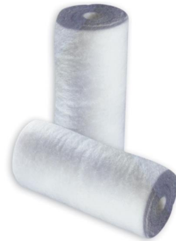
Figure 1: Aquaplex LD Filters