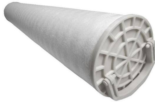
Figure 3: High Flow Z Depth Filter Cartridge