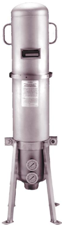
Figure 1: Single-Round High Flow Cartridge Filter Housings 1

1 Shown with optional clamp on stand and pressure gauges.