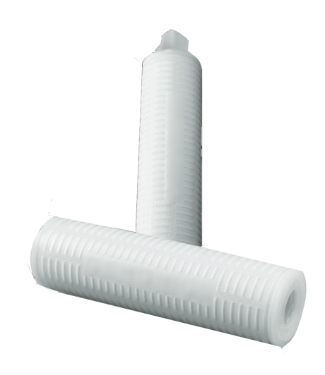
Figure 1: Memtrex KM Filters