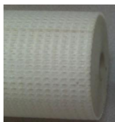
Figure 1: Robust Cage Outerwrap

The OSMO BEV ULE RO membrane element is 100% Wet Test Quality Assurance.