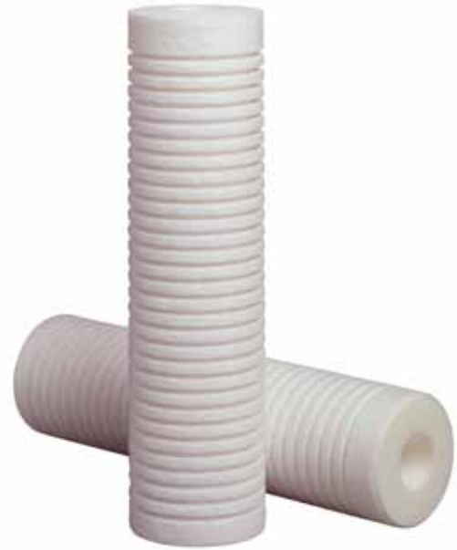
Figure 2. – Micro-Klean™ RT Series Filter Cartridges

Micro-Klean RT series filters are manufactured using 3M Purification's rigid extrusion bonded technology to achieve a rigid, coreless structure that resists unloading at higher differential pressures. An optimized groove pattern effectively doubles the filtering surface area, resulting in longer filter life and fewer change-outs. The unique thermally bonded fiber structure offers superior flow characteristics, resulting in flows up to ten times that of competitive filters for a given differential pressure. The result is a robust product that provides consistent filtration performance throughout the filter's long life.