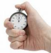
Quick Service Time

Items 5, 6, 7, 8 and 9 will establish the most appropriate size of filter. This is generally a compromise between those factors favoring a small filter (fast response time, smallest space requirement, lowest cost) and those factors favoring a large filter (long service intervals, low pressure drop).