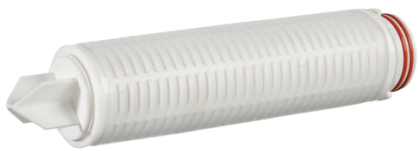
Figure 1: Memtrex FE Filters