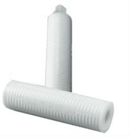
Figure 1: Flotrex HR pleated filters