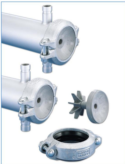
Figure 1: Stainless Steel Membrane Housings

Veolia's combines our rugged design of stainless steel membrane element housings with 30+ years of history in the applications of RO/NF/UF machine assembly.