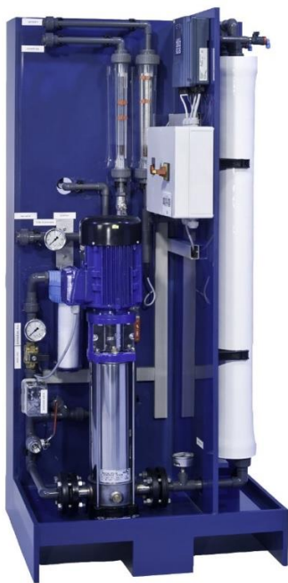
Figure 1: E4 CE Series

Medium reverse osmosis machines, 600 to 2700 liters per hour